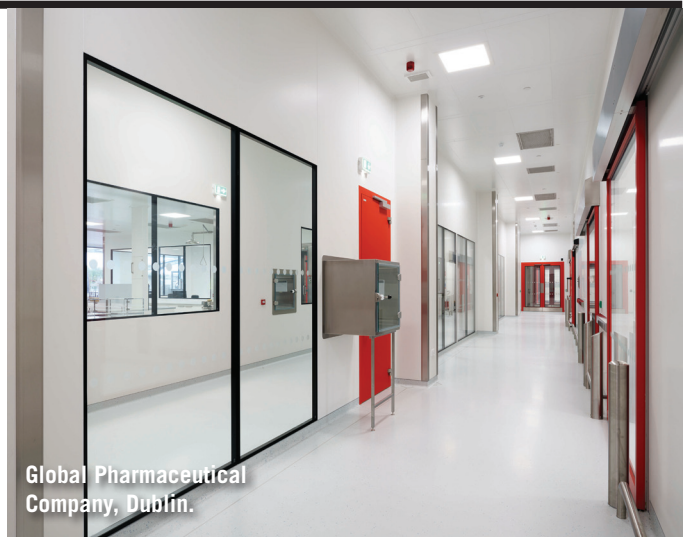
Global Pharmaceutical Company, Dublin.

A recent strategic project is the Design & Build of an 80-unit modular QC laboratory for a major pharma company in Swords.